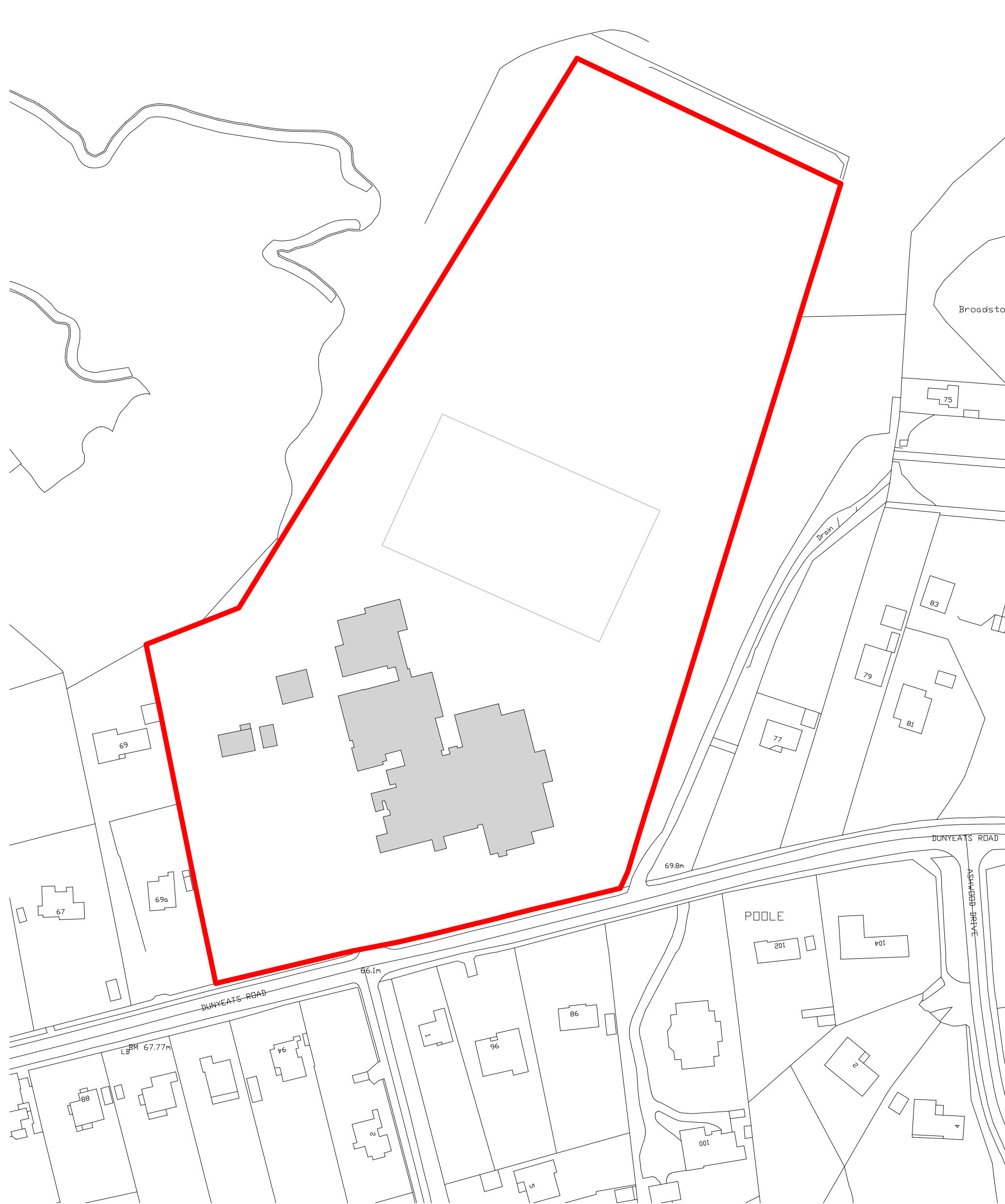
1 Location Plan (Existing) 1 : 1250