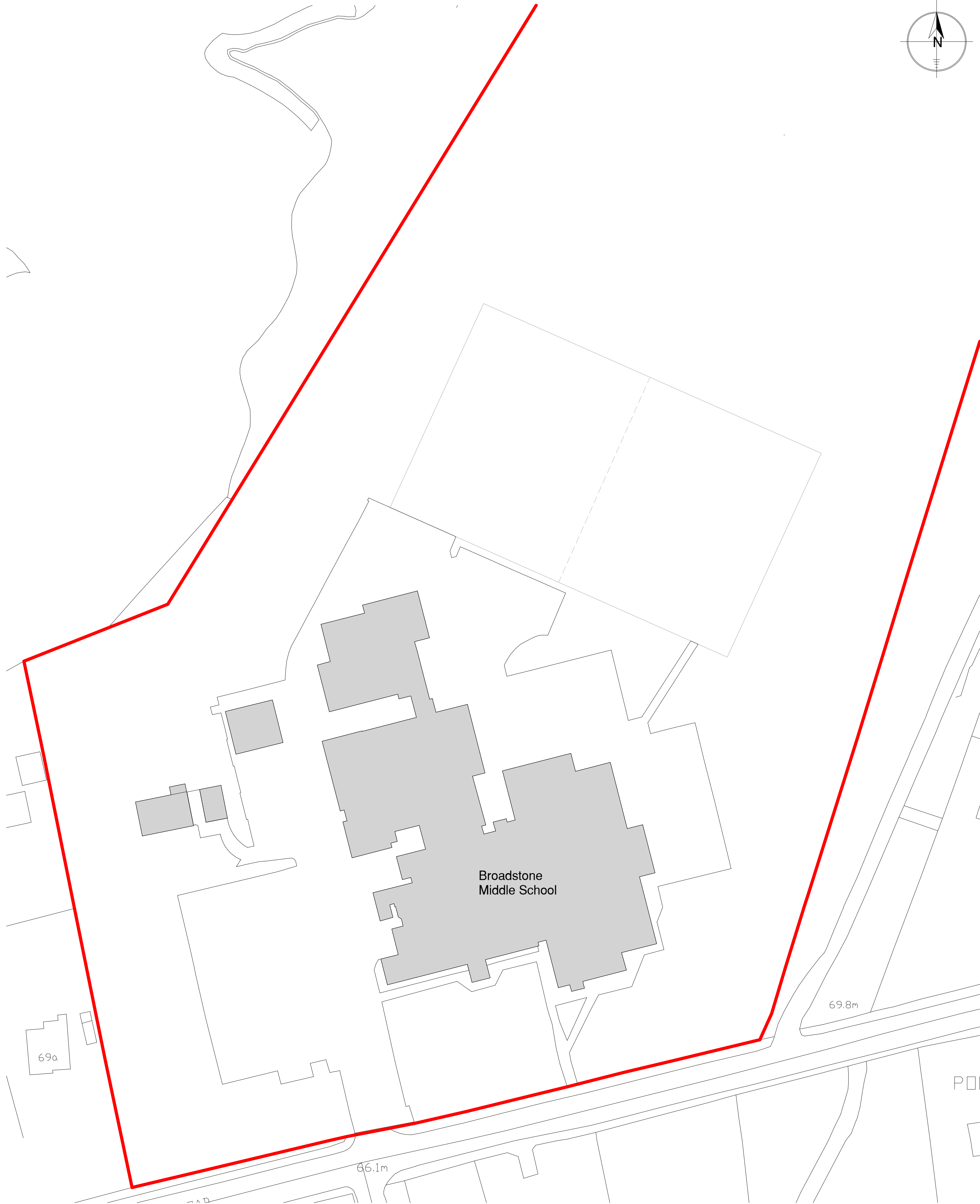
2 Block Plan (Existing) 1 : 500